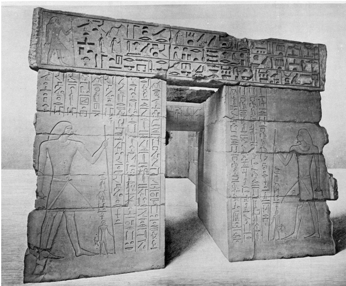
Fig. 1: The tomb chapel in its original museum setting. 4

The tomb chapel of Hetepherakhet is a monument that has intrigued me ever since I set foot in it for the first time. Once part of the necropolis of Memphis 1 , it is now one of the highlights of the Egyptian collection in the National Museum of Antiquities in Leiden (inventory no. F 1904/3.1). The chapel itself formed part of a much larger mastaba 2 originally built at Saqqara. It was first excavated by Auguste Mariette in the 1860's. 3 In 1902, the tomb chapel was purchased from the Egyptian government by the Dutch amateur archaeologist Adriaan Goekoop. It was shipped to the Netherlands in 70 crates, and first opened to the public in 1904 (see appendix 1).