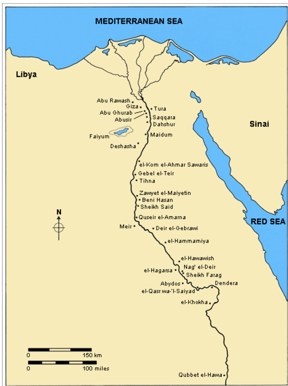
Fig. 2: Map of Old Kingdom burial sites. 5