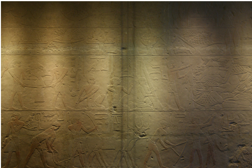
Fig. 4: Uneven lighting and seams in the glass panels.