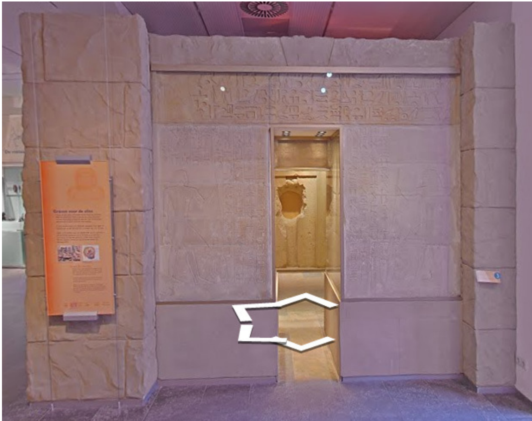
Fig. 3: Google Streetview image of the current situation. 25